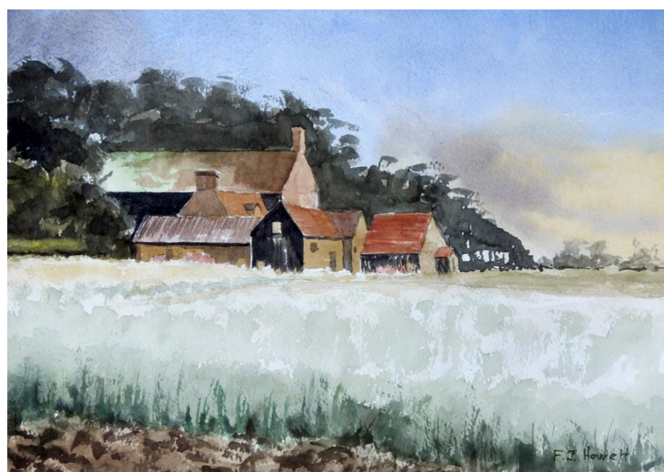
The Onion Field