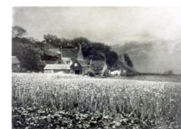
The photograph from which the painting was derived