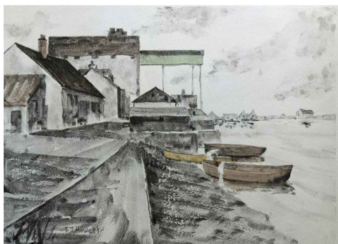
Wells next the Sea