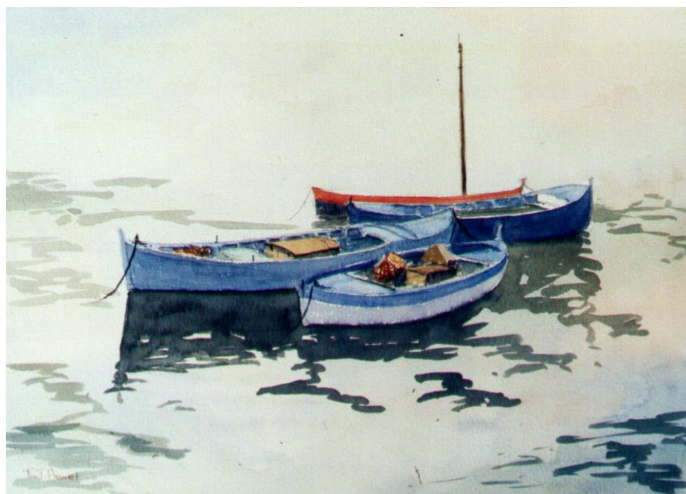
Boats at Villefranche